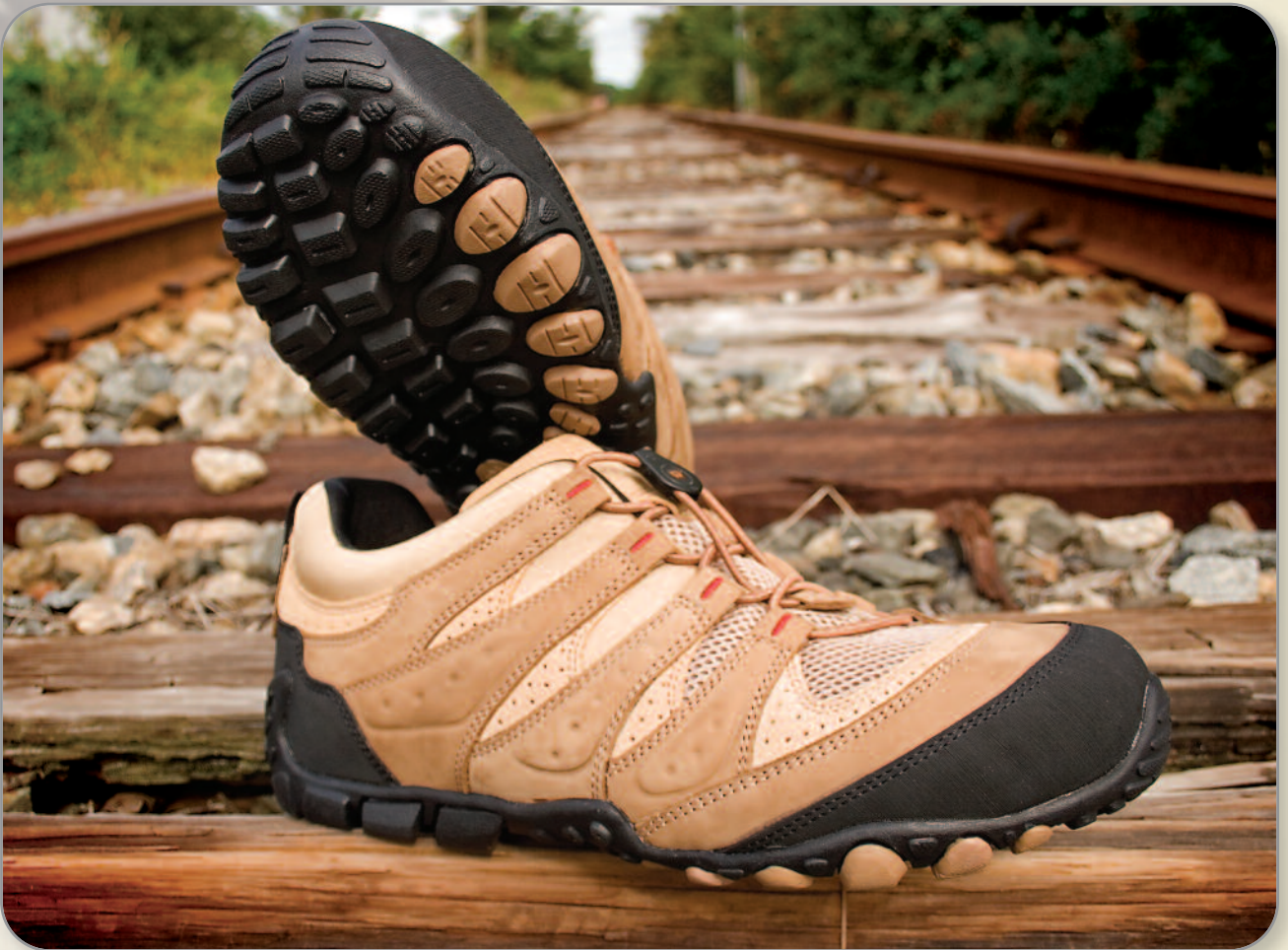
DESERT TAN TANTO LIGHT HIKER