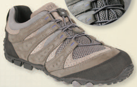
STEALTH GREY TANTO LIGHT HIKER